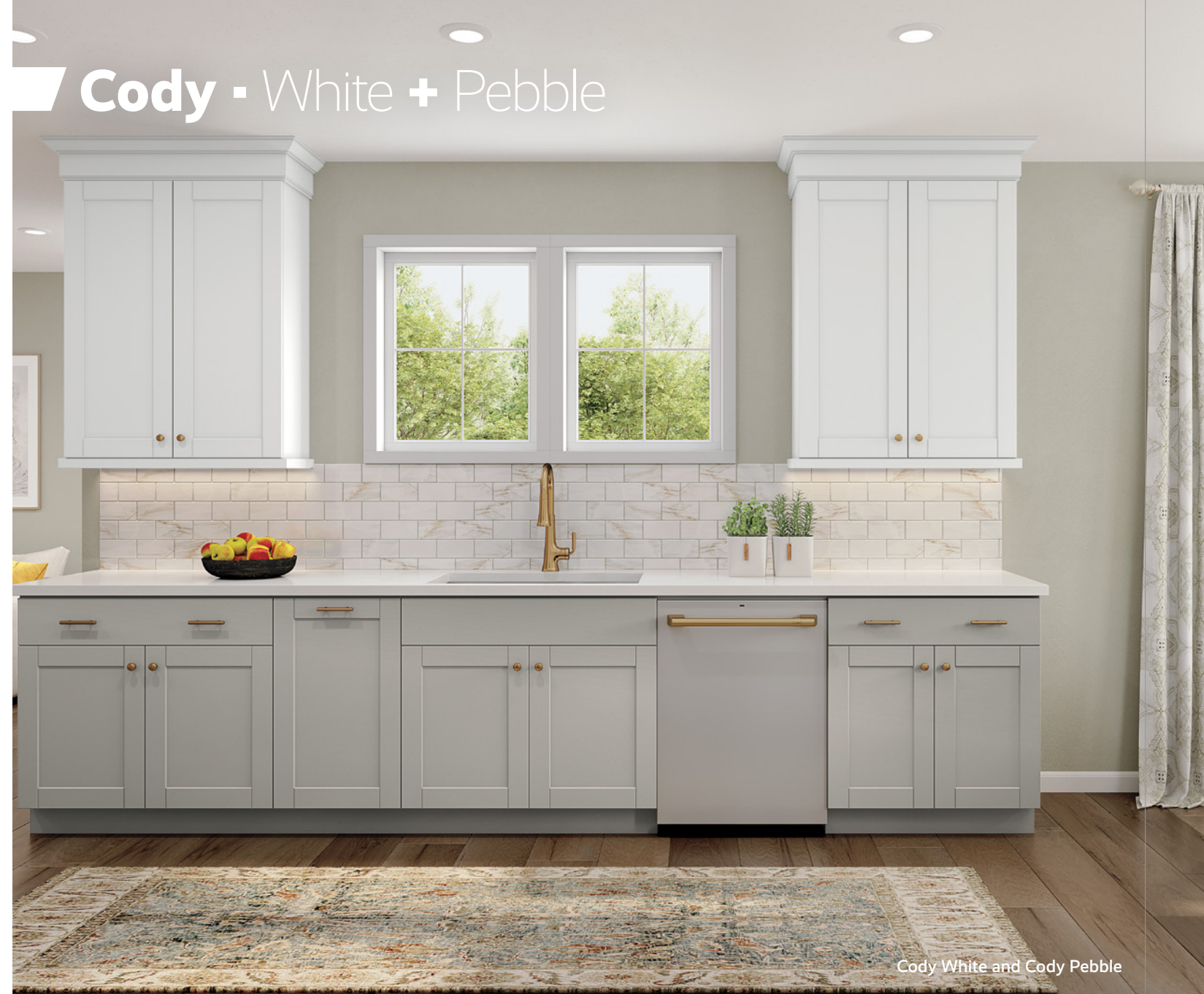
Cody - White + Pebble