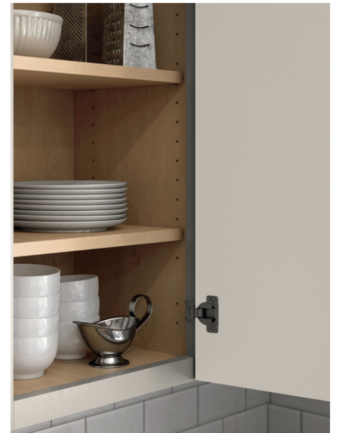
FULLY CONCEALED AND ADJUSTABLE HINGES