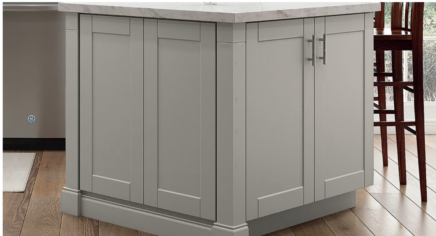
ISLAND END PANELS