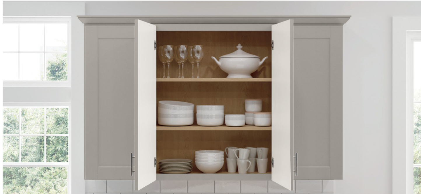
STANDARD BUTT DOORS ON CABINETS 27" WIDE AND UP

Transform your kitchen or space with smart, stylish upgrades that enhance functionality and design. Thoughtful additions can help you maximize storage with easy-to-reach cabinets and spacious drawers, create a seamless look by eliminating gaps around appliances, and keep counters and drawers organized.