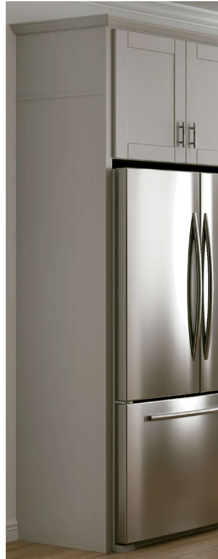
REFRIGERATOR RETURN KIT