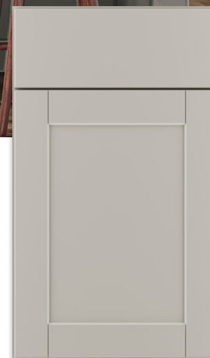
PEBBLE DOOR STYLE

This rich, earthy cool gray color creates a unique and versatile look. It brings a cozy, sophisticated vibe to any space, perfectly balancing traditional and modern styles.