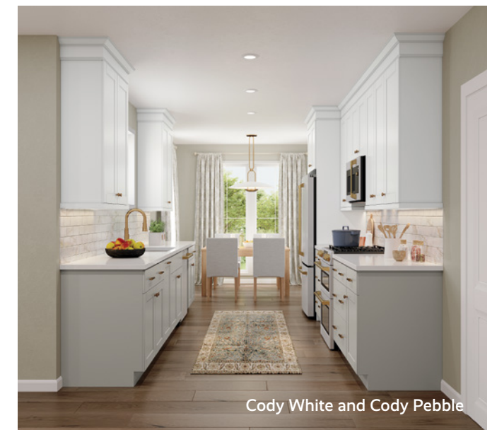
Cody White and Cody Pebble

Two-tone kitchens are a stylish and versatile way to add personality and visual interest to your home. Use lighter tones on upper cabinets and darker shades on lower cabinets to draw the eye upward and give a room a more open, airy feel. Contrasting colors can also highlight key features, such as a beautiful island or unique backsplash, drawing attention to the items you want to showcase.